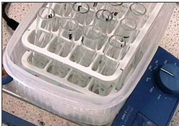
Figure 1. Arrangement of ice-water bath over a magnetic stirrer for treatment of samples with 2 M KOH and dissolution of RS.

Total starch content is the sum of resistant starch and non-resistant (solubilised) starch.